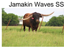
Jamakin Waves SS