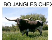
BO JANGLES CHEX